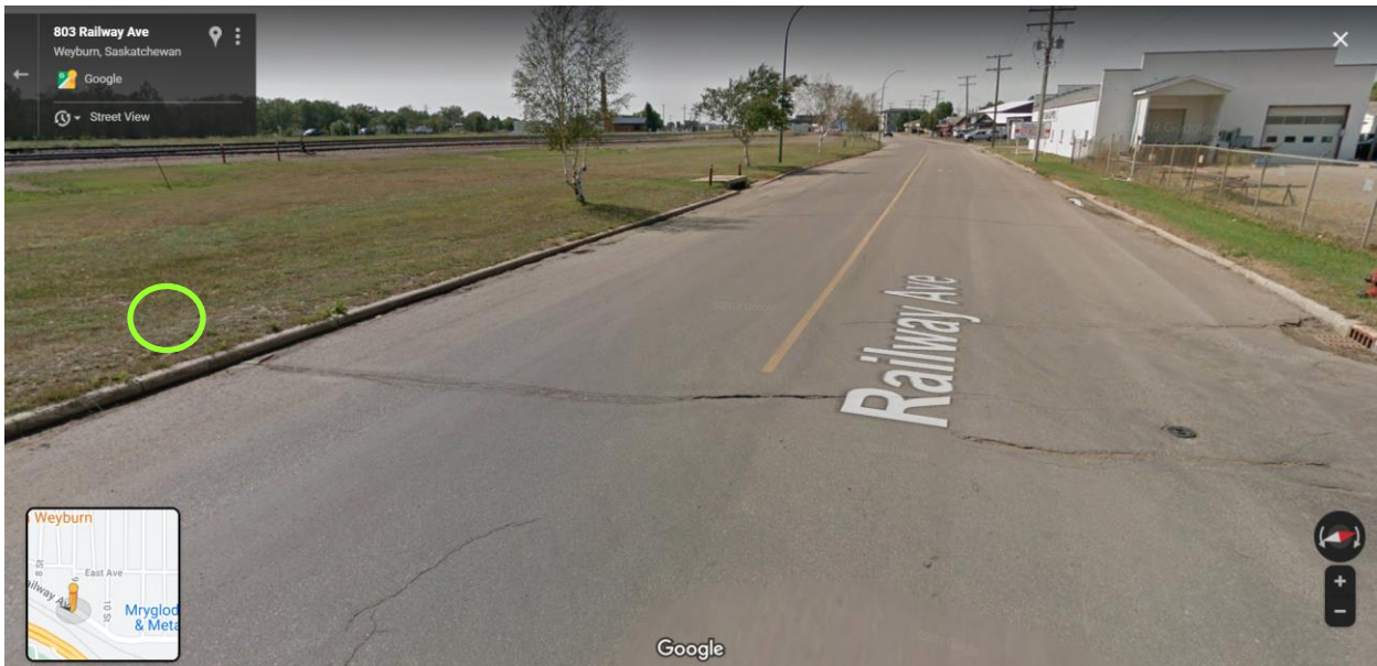
Figure 4: 9 th Street and Railway Avenue - Valve # 657