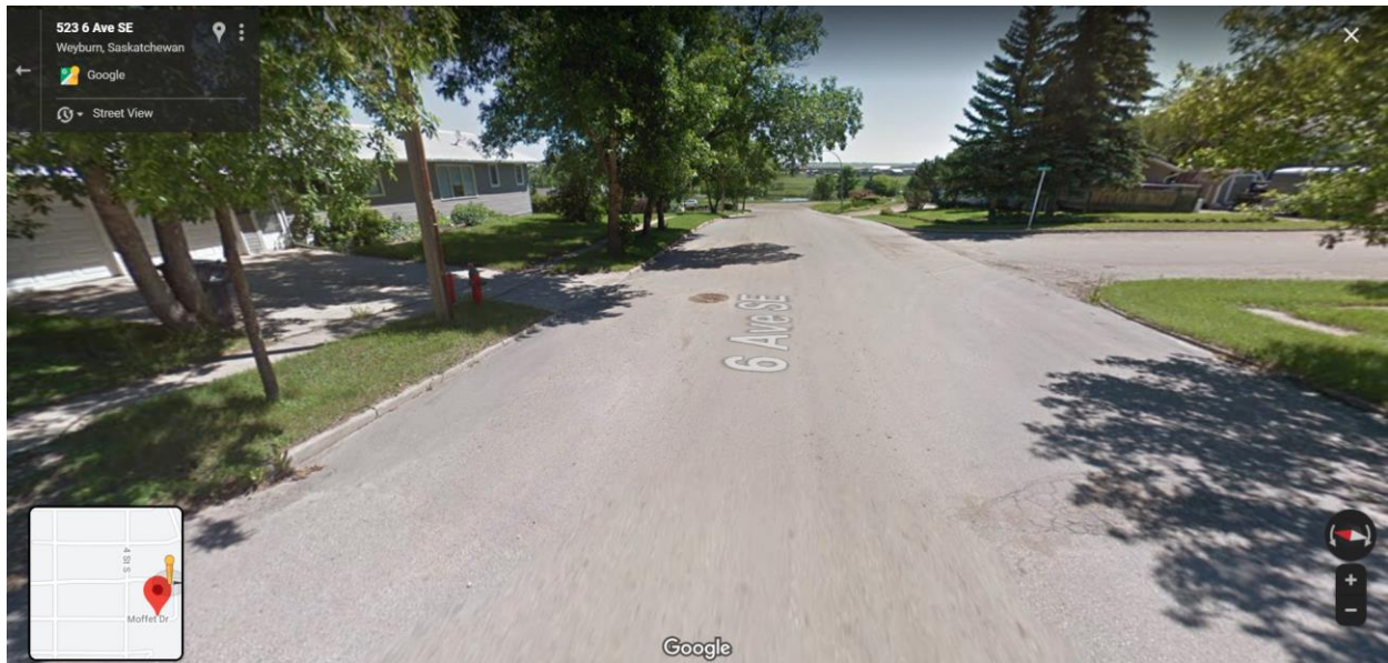
Figure 5: Moffet Drive and 6 th Avenue SE - Hydrant # 198