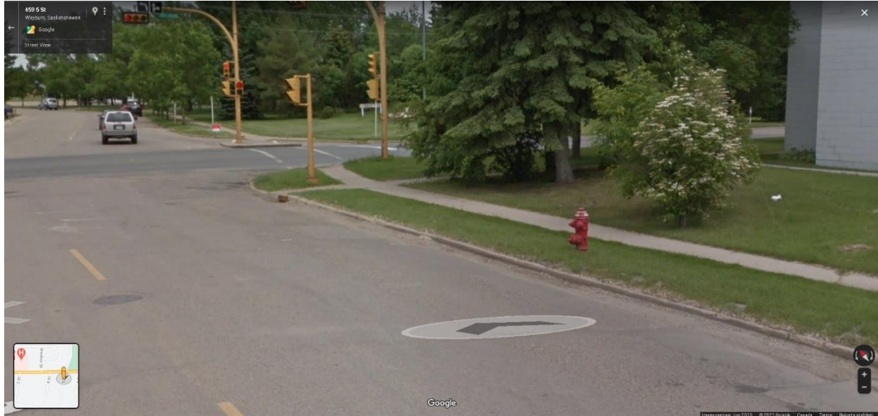
Figure 1: 5 th Street and 1 st Avenue NE - Hydrant # 34