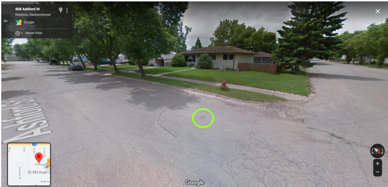
Figure 3: Ashford Street and Hartney Avenue - Valve # 87