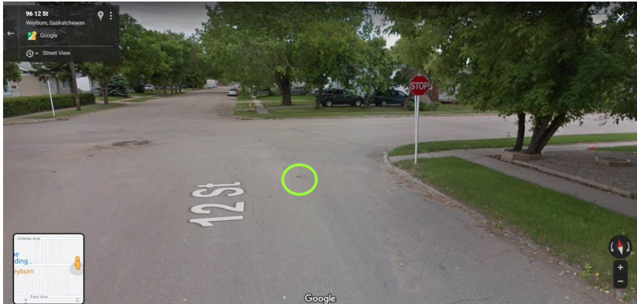
Figure 1: 12 th Street and Souris Avenue - Valve # 167