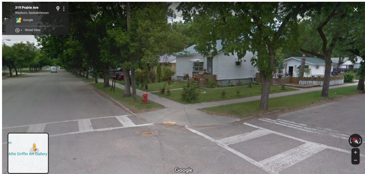
Figure 2: 4 th Street and Prairie Avenue - Hydrant # 45