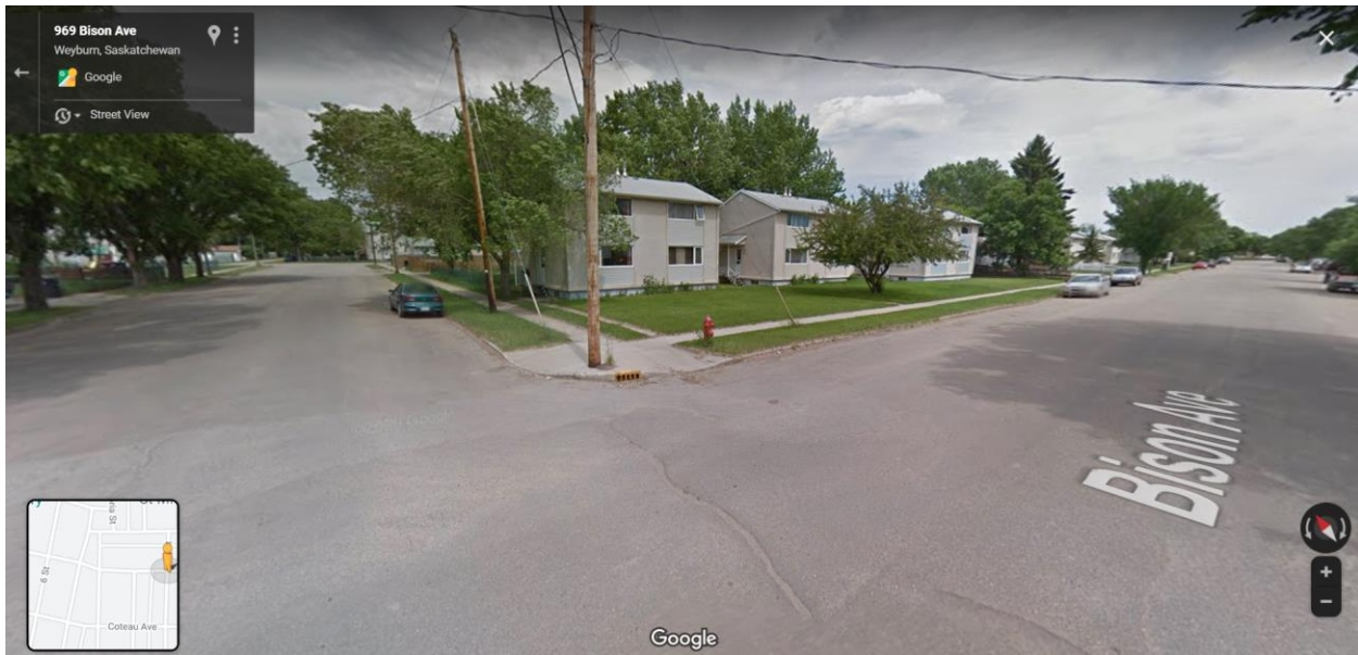
Figure 3: 10 th Street and Bison Avenue - Hydrant # 73