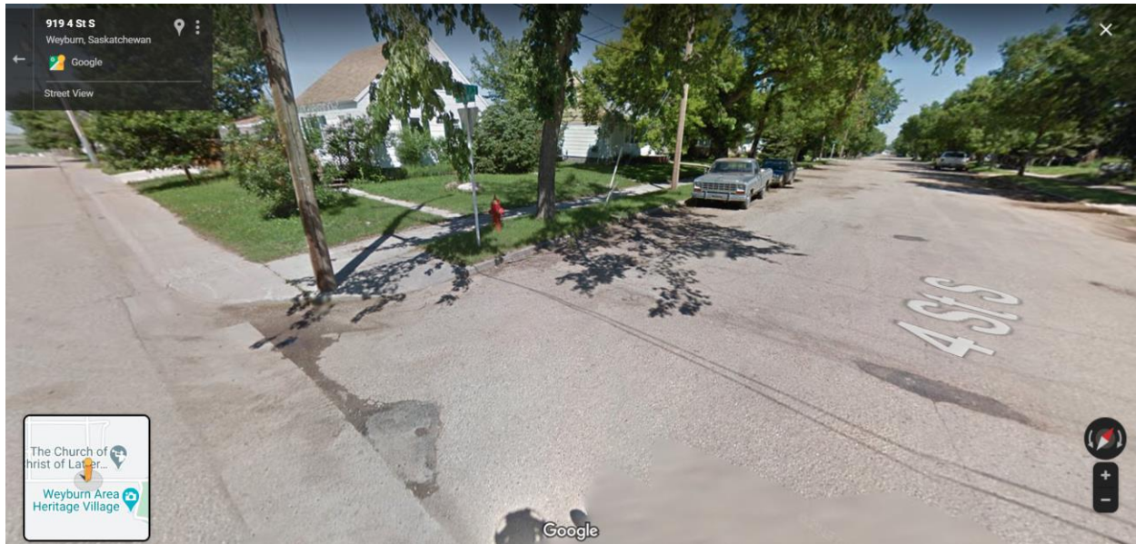
Figure 4: 4 th Street and 10 th Avenue S - Hydrant # 143